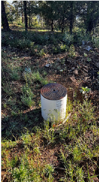
Water Meter by Street